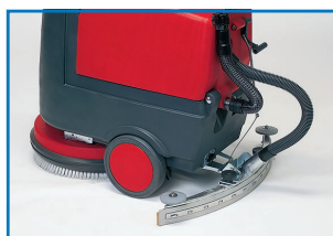
Example of a curved suction nozzle