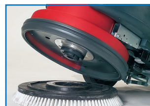
Easy brush assembly