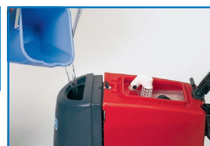
Large filling hole